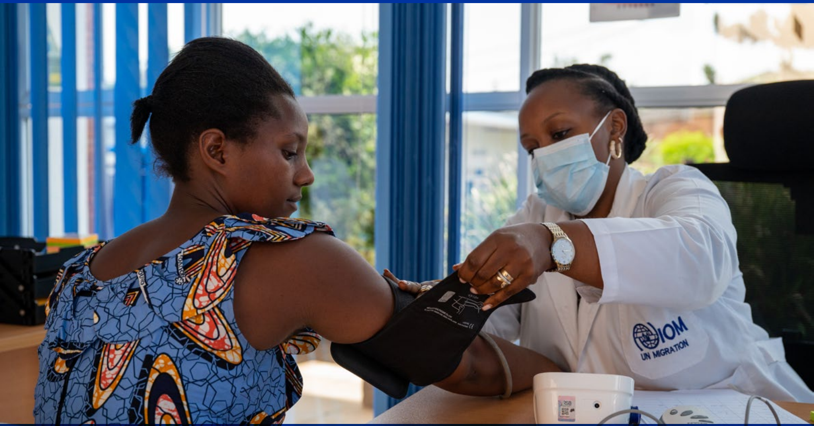
One of the Migration Health Nurses taking history for a patient at the MHAC in Kigali.