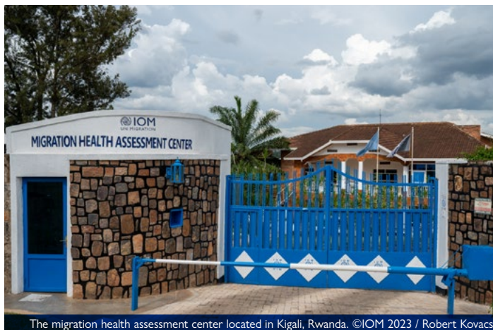
The migration health assessment center located in Kigali, Rwanda.

IOM Rwanda's migration health assessment center (MHAC) in Kigali is the medical clinic that provides health assessment and travel assistance services for migrants and refugees traveling temporarily or permanently to the United States, Canada, Australia, the United Kingdom and various countries across Europe. The health assessments are conducted by highly trained and experienced migration health physicians and migration health nurses based on the protocols defined by receiving countries. In 2022, IOM Rwanda conducted over 10,400 health assessments and 4,027 pre-embarkation checks .