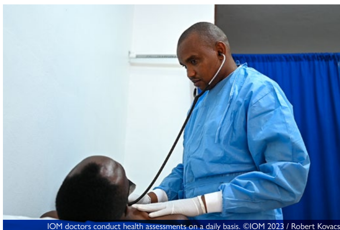
IOM doctors conduct health assessments on a daily basis.

IOM offers pre-departure travel health services, including presumptive treatment for endemic conditions like malaria, intestinal parasites and diagnostics and treatment for tuberculosis and sexually transmitted infections. IOM also offers an array of specialized counseling services ensuring the safe and dignified travel of refugees to their destination countries.